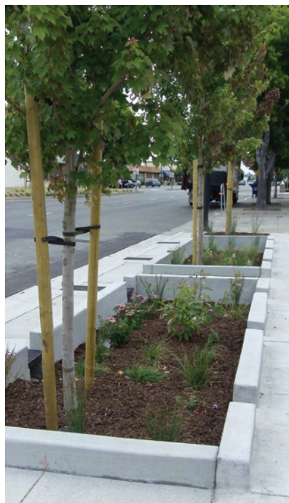
Stormwater planters on San Pablo Avenue in El Cerrito.

9 In the lunch/break room, replace disposables with permanent items (e.g.,