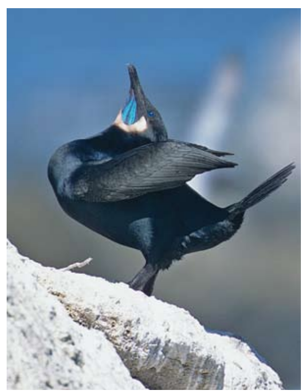
PETER LA TOURETTE

Great blue heron and great egret brood sizes have shown declines since 1991 (Figure 24), but the pattern differs somewhat depending on the region of the Bay. The decline in brood size is more pronounced for great egrets, whose brood size has declined 17 percent in the Bay as a whole, when comparing the most recent three years (2006–2008) to 1991–1995. Combining results from the two species reveals no decline in the Central Bay, but a pronounced decline in